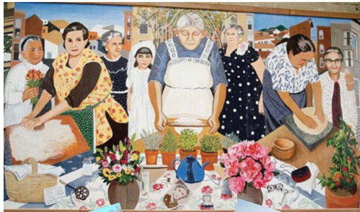
East Boston Mural