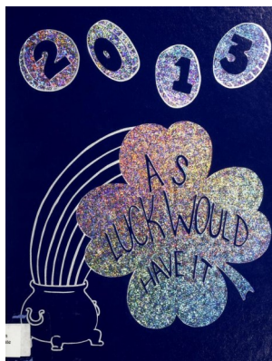
Stoneham Yearbooks [ Yearbook Tutorial ]