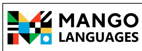
Mango [ Mango Language Tutorial ]